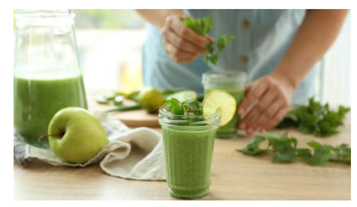
Unlimited detox soup, herbal tea, pH10 water