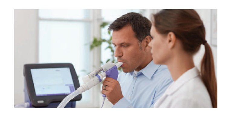
Spirometry for Respiratory Function Measurement