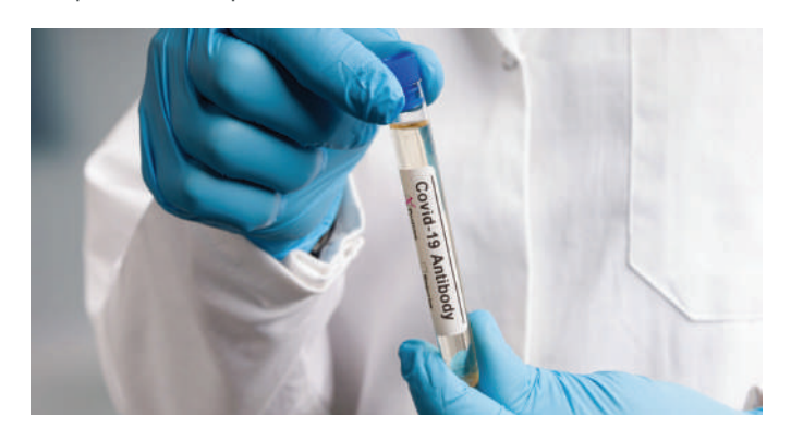
COVID-19 Antibody Test (Upon Request)