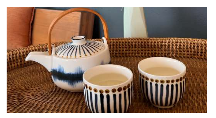
Unlimited detox soup, herbal tea, pH10 water